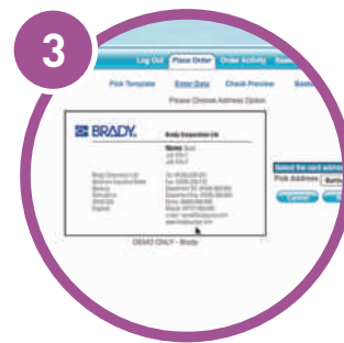
Proof and approve instantly on screen