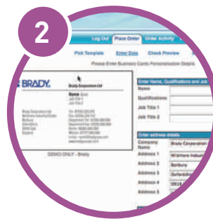
Input your details