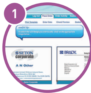
Choose your template

Features such as tailor-made templates and on-screen proofing make the process error-free.